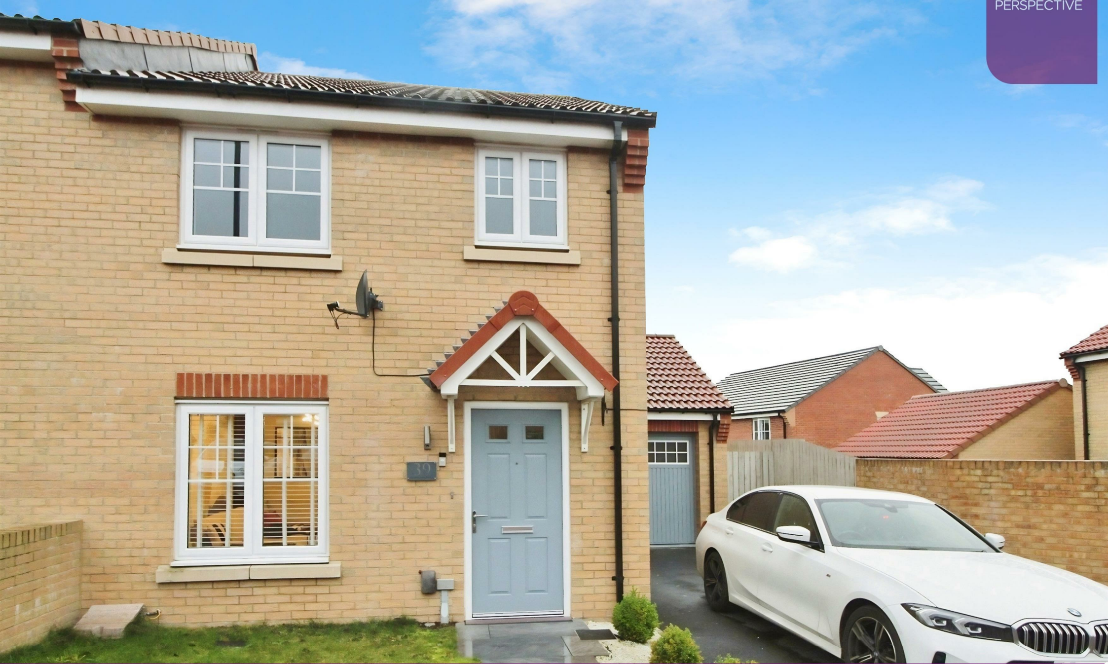
39 Brambling Drive, Guisborough, TS14 8LY £229,995